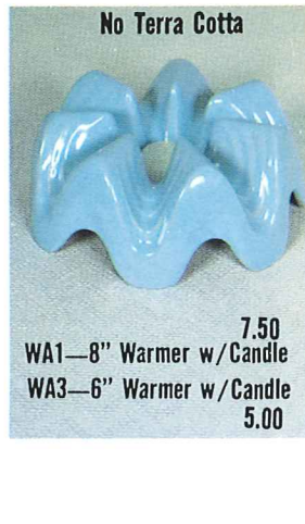
No Terra Cotta