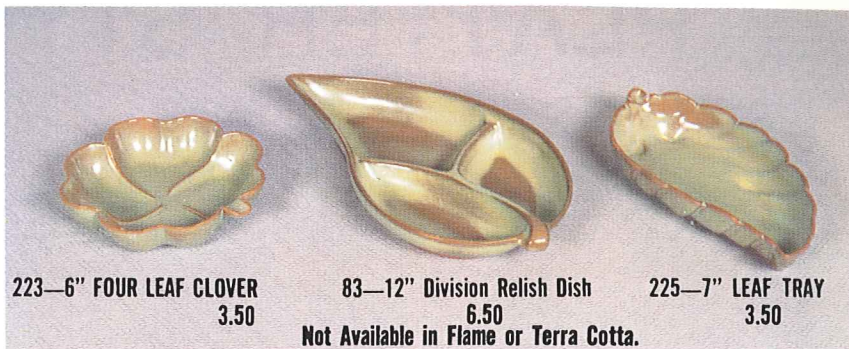
223—6" FOUR LEAF CLOVER 3.50 83—12" Division Relish Dish 6.50 225—7" LEAF TRAY 3.50 Not Available in Flame or Terra Cotta.