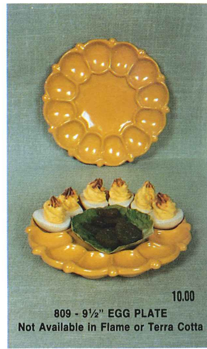
10.00 809 - 9½" EGG PLATE Not Available in Flame or Terra Cotta