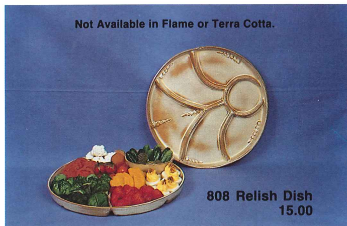
Not Available in Flame or Terra Cotta.