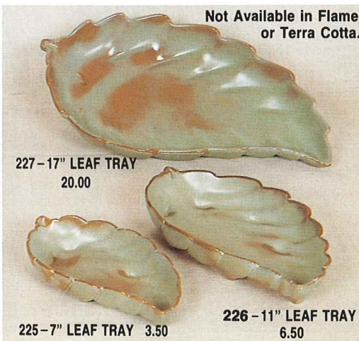
Not Available in Flame or Terra Cotta.