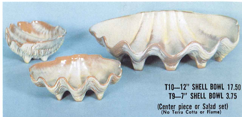
T10—12" SHELL BOWL 17.50 T9—7" SHELL BOWL 3.75 (Center piece or Salad set) (No Terra Cotta or Flame)