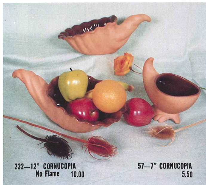
222—12" CORNUCOPIA No Flame 10.00 57—7" CORNUCOPIA 5.50