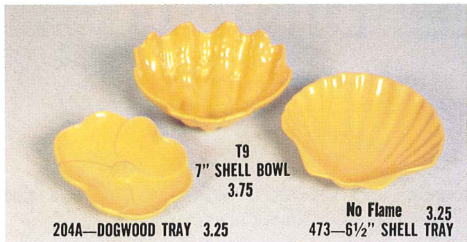
T9 7" SHELL BOWL 3.75 204A—DOGWOOD TRAY 3.25 No Flame 3.25 473—6½" SHELL TRAY